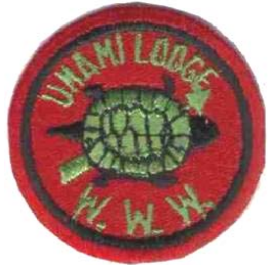
A Round Patch, Unami Lodge, R-8

Once you get started collecting your own lodge, it is easy to get interested in other lodges. Many collectors collect patches from nearby lodges such as the other lodges in their section, state, or region.