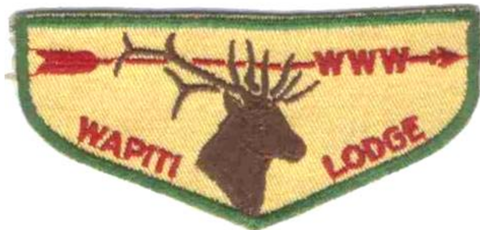
Wapiti Lodge, First Flap, Geer Shaped, F-1, Cut Edge

There are many more lodges. Every number up to 567 has been used along with a few larger numbers: 578, 614, 617, 618, and 619. Not all lodges issued patches, however. Among the first five numbers, Unami, Sanhican, Nawakwa, Ranachqua, Minsi, and Kittatinny issued patches, while Trenton, Pamunkey, and Indiandale probably did not. Some early lodges only issued neckerchiefs or non-flap shaped patches. Number collectors try to get a patch from all numbers, so obtaining either a Lodge #5 Minsi or a Lodge #5 Kittatinny is sufficient for a pure numbers collector. Note that there is not a patch for every number. Other collectors try to get a patch from every name and number. Lodges have had numbers throughout most of our OA history, from 1915 through 2003, but recently, the national OA committee eliminated lodge numbers. It is quite likely, however, that lodges will continue to use their historical numbers for a long time to come.