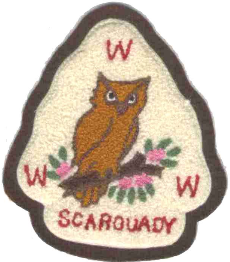
A Chenille, Scarouady Lodge, C-1

Some collectors just collect one patch from each lodge, some collect a few, and some collect every issue. Some just collect older issues; some collect newer issues. Some lodge issues are especially sought after. The first flap-shaped patch from each lodge is called a “first flap.” First flaps are highly collectible and are usually more desirable than even rarer issues that may have come later. The lodge’s first odd shape (round, arrowhead, square, dome, shield, and so on, any shape but flap shaped) is also very collectible. Some people like the first solidly-embroidered flap. Some people like Vigil flaps.