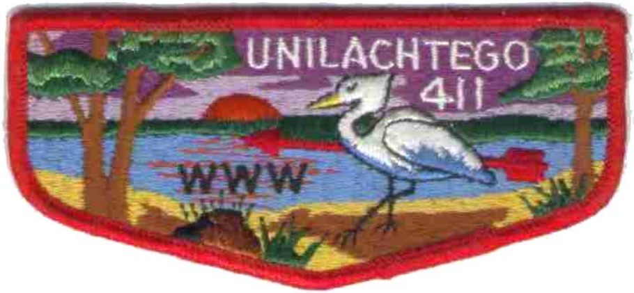
A Solidly-Embroidered Flap, Unilachtego Lodge, S-1, Rolled Edge

When you hear collectors talking about patches, you will hear lots of letters and numbers: A-1, F-2, S-3, and so on. This is how patches are described. S means solidly embroidered and flap-shaped. F refers to a flap where part of the background is cloth or twill. A means arrowhead, C means chenille, R means round, J means jacket patch, P means pie-shaped for a neckerchief, and X means any other shape. The first F is F-1, the second is F-2, and so on.