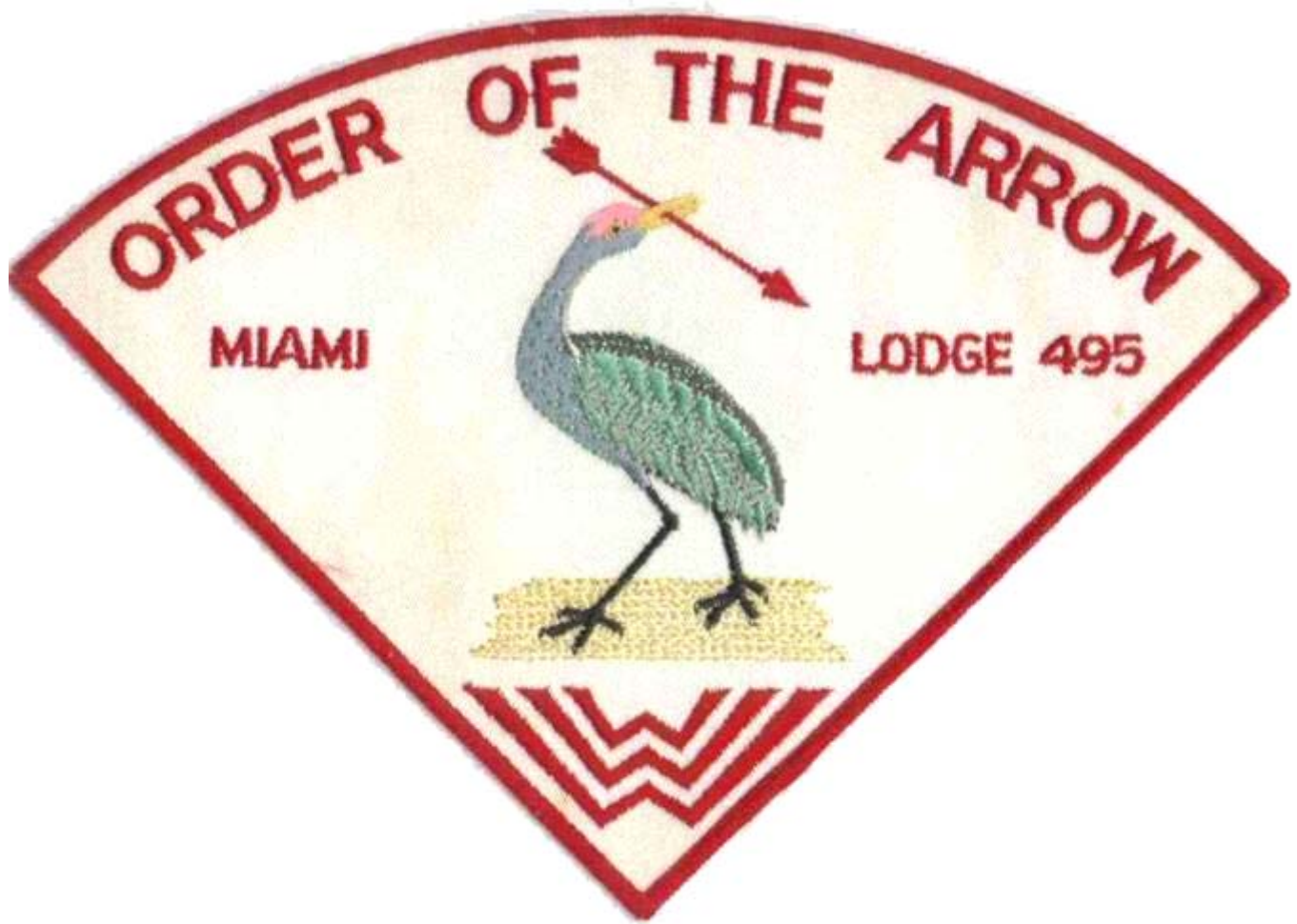
A Pie-Shaped Neckerchief Patch, Miami Lodge, P-1, Rolled Edge