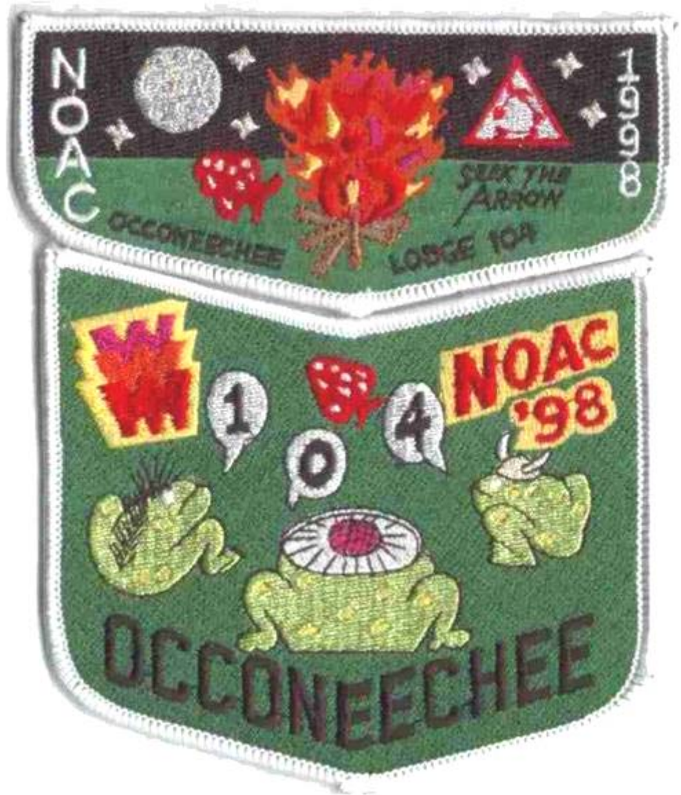
A NOAC Two-Piece Set, Occoneechee Lodge, S-32 & X-12

If you can buy extra lodge activity patches for less than you pay for lodge flap, you can usually trade them later for flaps.