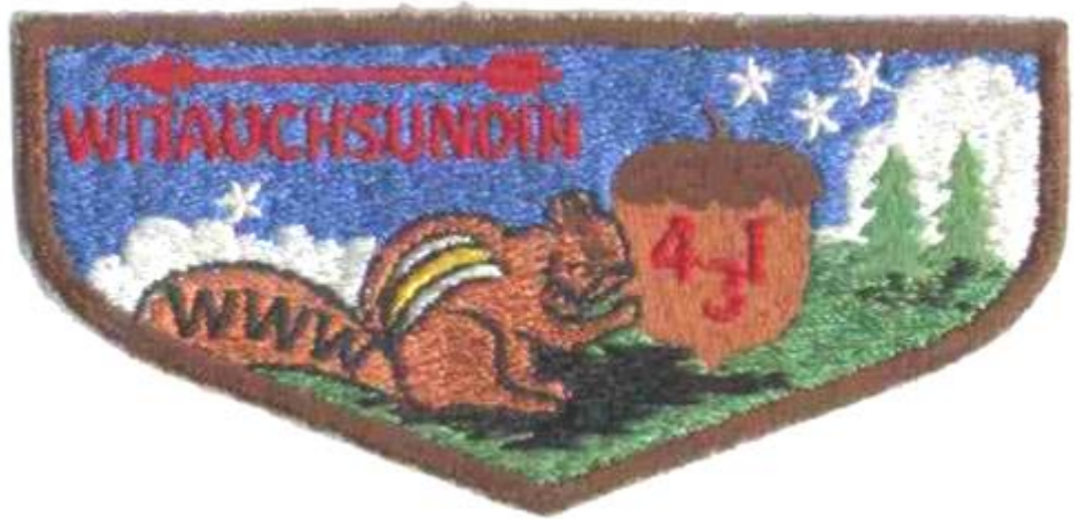
A Solidly-Embroidered Flap, Witauchsundin Lodge, Geer Shaped, S-1, Cut Edge

When you begin trading, just trade one-for-one: one of yours for one of theirs. If someone wants two for theirs or ten for theirs, find someone else to trade with. As your knowledge grows, and you learn which patches are more valuable and which are more common, you can start acquiring more valuable patches. There are thousands of OA patches that you can get with a one-for-one trade. Don't worry that you may not get a certain cool patch that you really like. You will almost certainly find it available again.