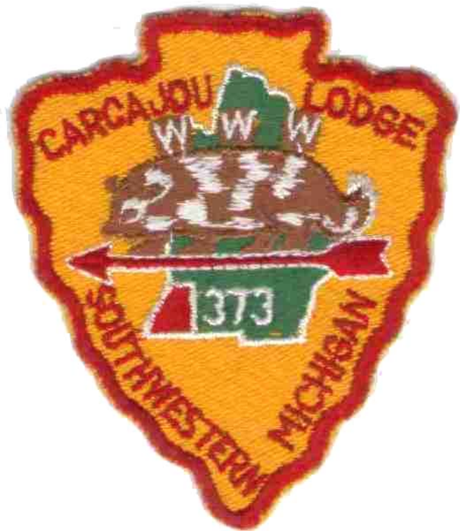
An Arrowhead-Shaped Patch, Carcajou Lodge, A-1, Cut Edge

We often say “knowledge is key!” This means that it is important to learn as much as you can about the area you collect. The more you know, the better you can do, both in life and in collecting. Most older traders are glad to help you learn. Also, there are books about OA patches and about many other areas of collecting. Ask other traders to show you their books. Eventually, as your collection grows, you will want to obtain some books yourself. Every OA collector should have a Pocket Blue Book. The Pocket Blue Book contains a picture of one patch from every lodge, past and present along with other useful information. You can usually just trade a single flap for one. As you become interested in issues, you should get the full Blue Book. The Blue Book is a two-volume reference work that lists every issue of every lodge.