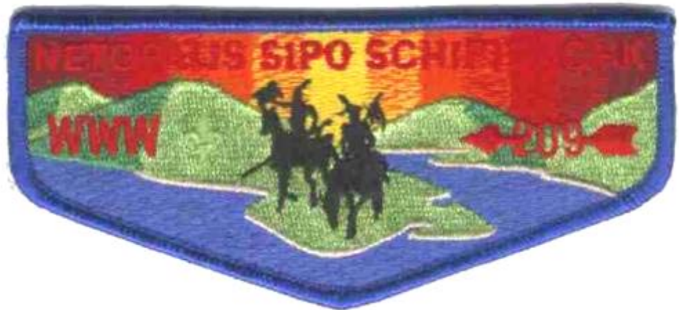
A Solidly-Embroidered Flap, Netopalis Sipo Schipinachk Lodge, S-1, Rolled Edge, a New Lodge

Some flaps are "restricted," which means that the number that you can buy is limited. Some flaps may be one or two per OA advancement (Ordeal, Brotherhood, and Vigil) or one awarded for every so many hours of service. Restrictions were more common years ago, but some lodges still restrict their patches. If your patches are restricted, do not trade them one for one for unrestricted patches. You are better off getting unrestricted patches