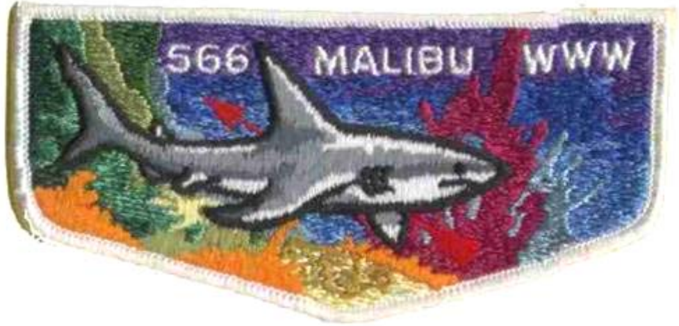
A Solidly-Embroidered Flap-Shaped Patch, Malibu Lodge, S-1

Almost everyone who collects Boy Scout patches has at least a small OA collection. Most people start by saving a flap from their lodge. Then they keep buying the new issues as they come out. If you buy an extra patch each time, then you will have duplicate patches to trade in the future. Next, you can try to obtain older issues and activity patches from your lodge. Your local OA lodge functions, fellowships, pow-wows, and area conclaves are usually a good source for older patches. Other sources include Trade-O-Rees, eBay, Jamborees, and National OA Conferences.