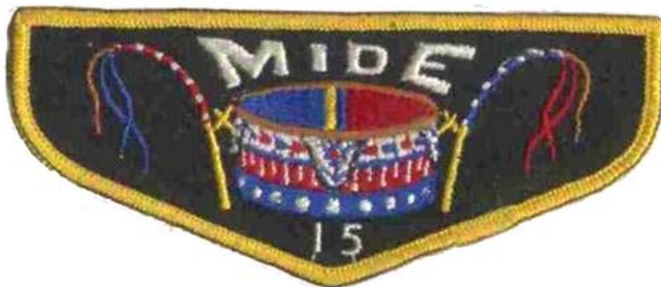
Mide Lodge, First Flap Moritz Shaped, F-1, Flat Rolled Edge