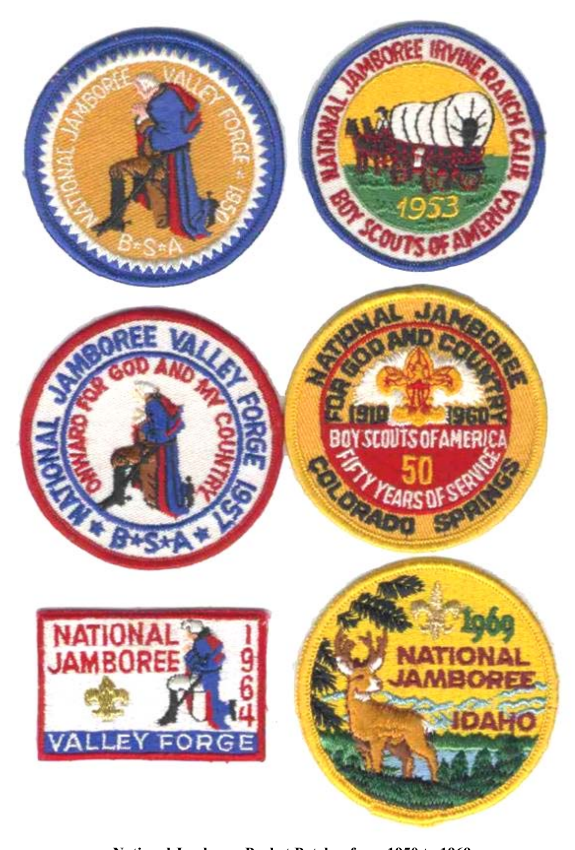
National Jamboree Pocket Patches from 1950 to 1969