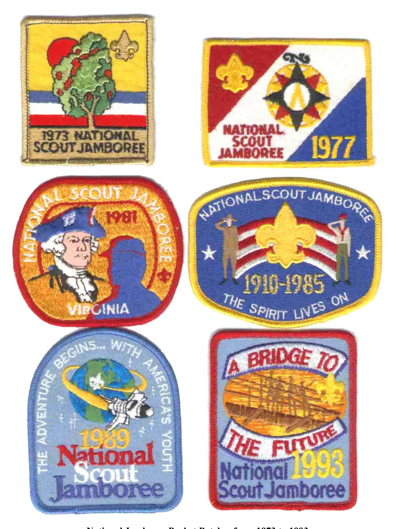
National Jamboree Pocket Patches from 1973 to 1993