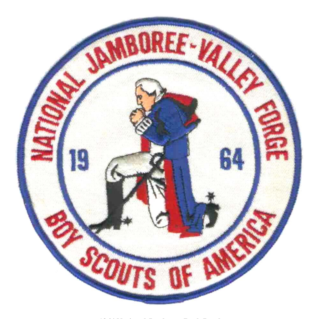
1964 National Jamboree Back Patch Most jamboree back patches look just like the pocket patch, only bigger. That was not true in 1964, 1997, and 2001.