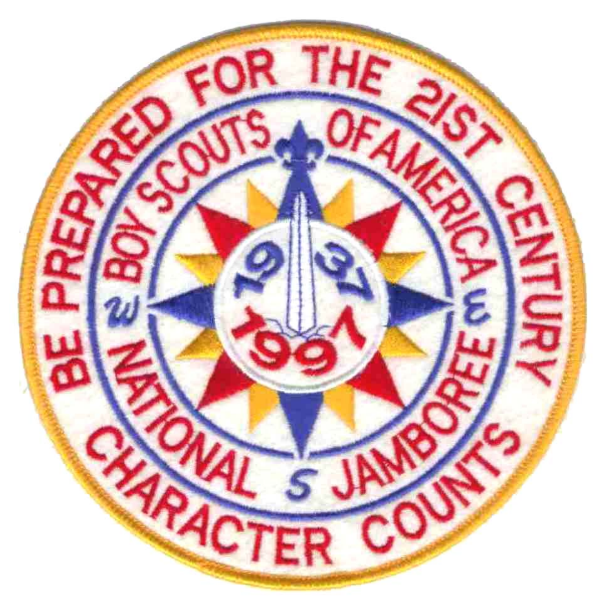
1997 National Jamboree Back Patch