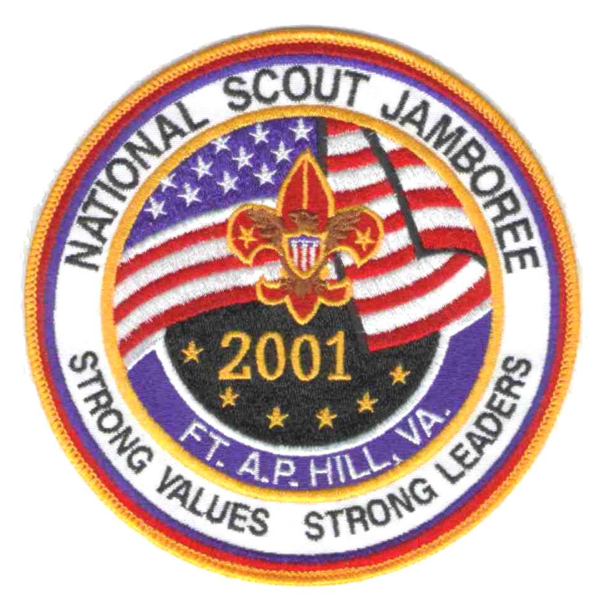
2001 National Jamboree Back Patch