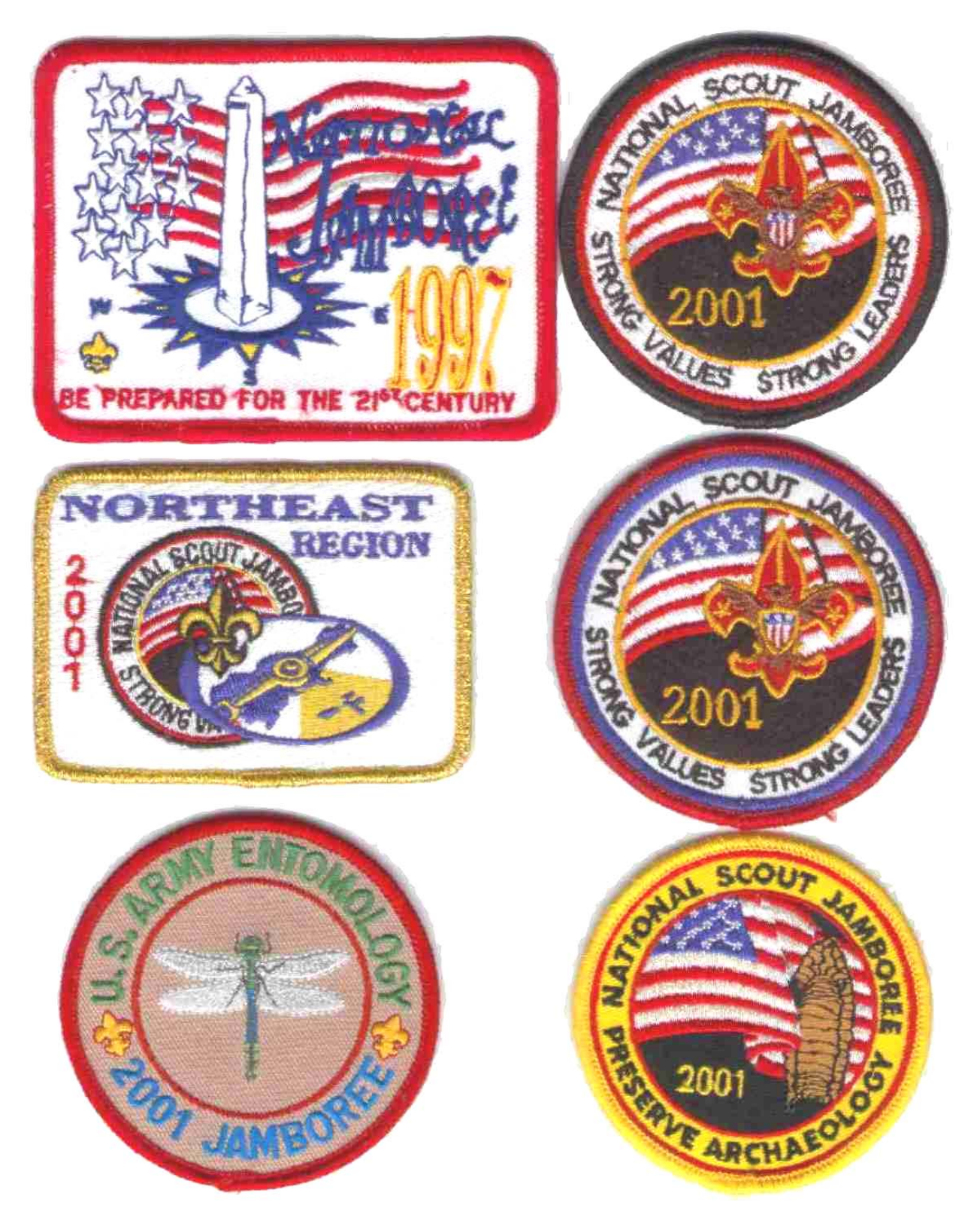
National Jamboree Pocket Patches from 1997 to 2001 Also pictured are some additional patches from the 2001 jamboree.